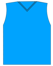
V NECK SLEEVELESS